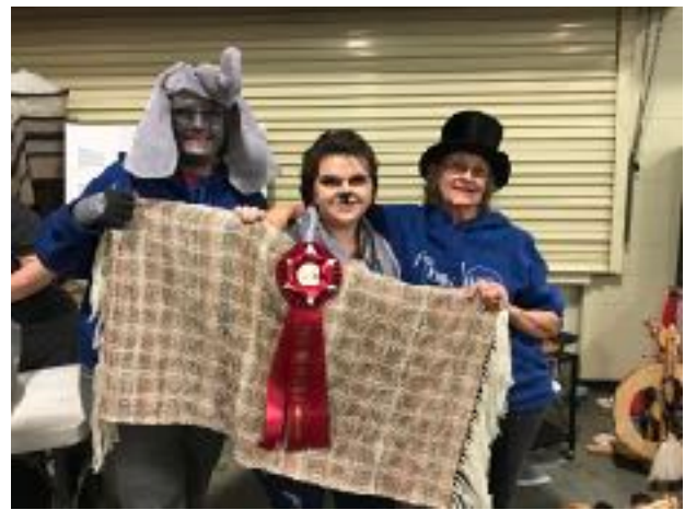
Fleece to shawl competition: